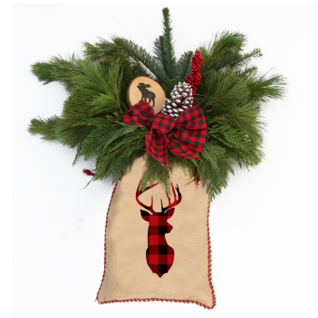
Hanging Greenery Bough $50.00