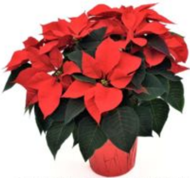
Red Poinsettia $14.00

https://chcs.growingsmilesfundraising.com