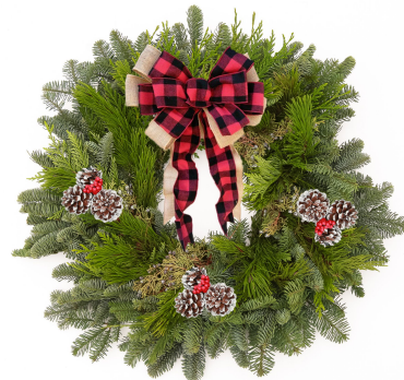
Holiday Wreath $35.00