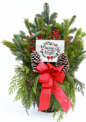
Outdoor Greenery Bough $35.00