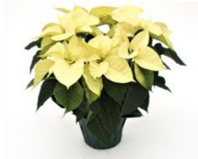
White Poinsettia $14.00