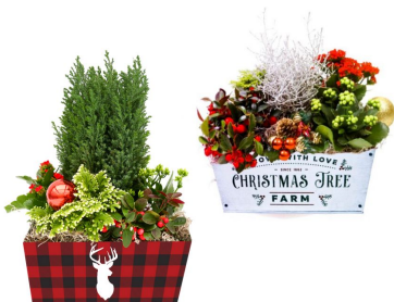
Tropical Indoor Planter $35.00